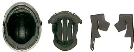
3-D FULL SUPPORT INTERIOR, TYPE-3 Each component of the

The X-Eleven is equipped with an air outlet vent at the lower rear neck area to allow for effective air exhaust.